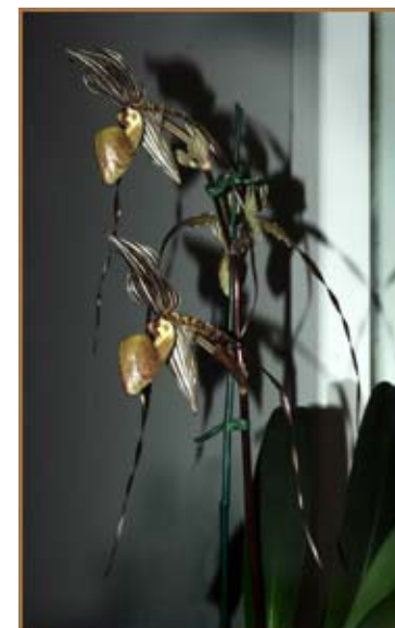
Paph. St Swithin