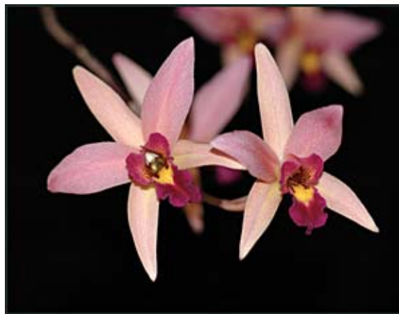
L. Santa Barbara Sunset