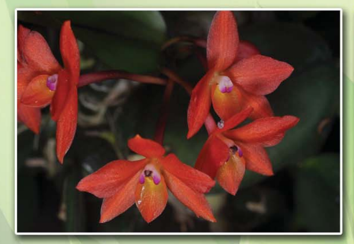
Plant name: Sophronitis cernua Grown by: Sung Lee