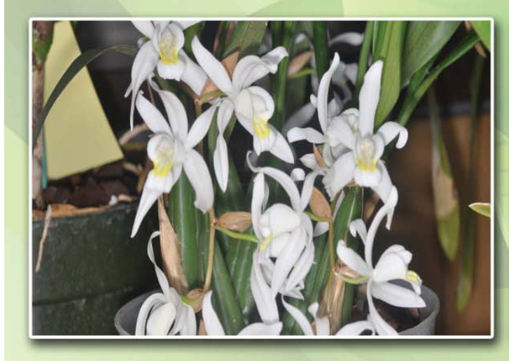
Plant name: Coel mossiae Grown by: Eileen Jackson