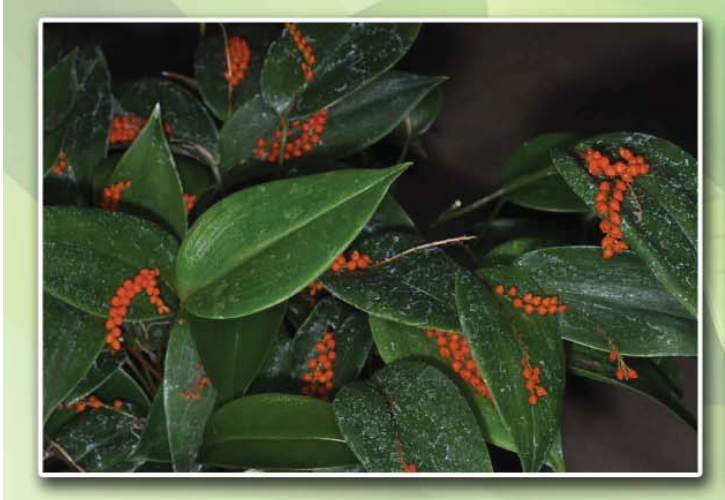
Plant name: Pleur trancata 'Cow Hollow' Grown by: Yunor Peralta