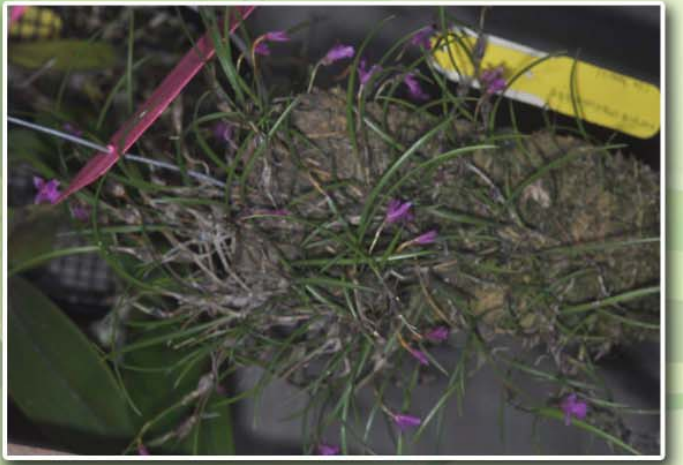
Plant name: Isabelia pulchelia Grown by: Tom Pickford