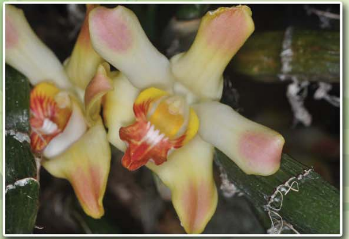
Plant name: Chysis langlesis 'Golden' Grown by: Phyllis Arthur