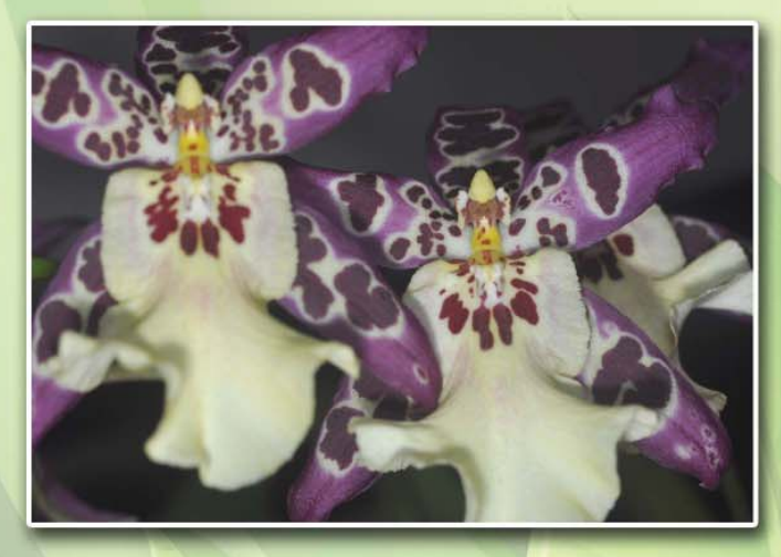
Plant name: Unknown Grown by: Eileen Jackson