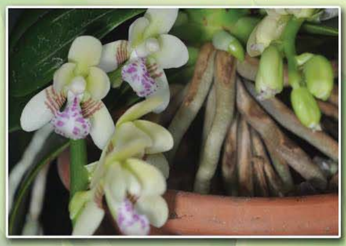
Plant name: Unknown Grown by: Eileen Jackson