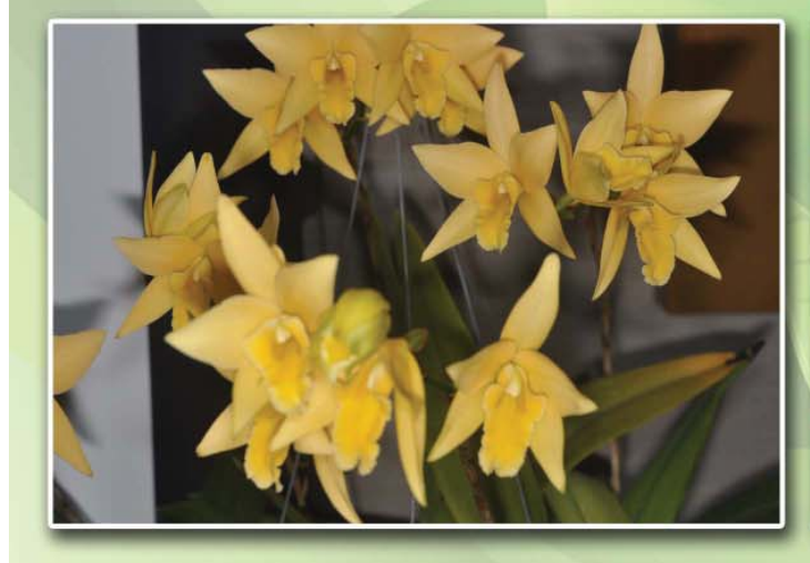
Plant name: Lc canariensis Grown by: Tom Pickford