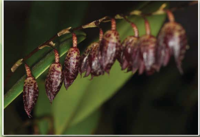
Plant name: Pleur restepiodes Grown by: Eileen Jackson