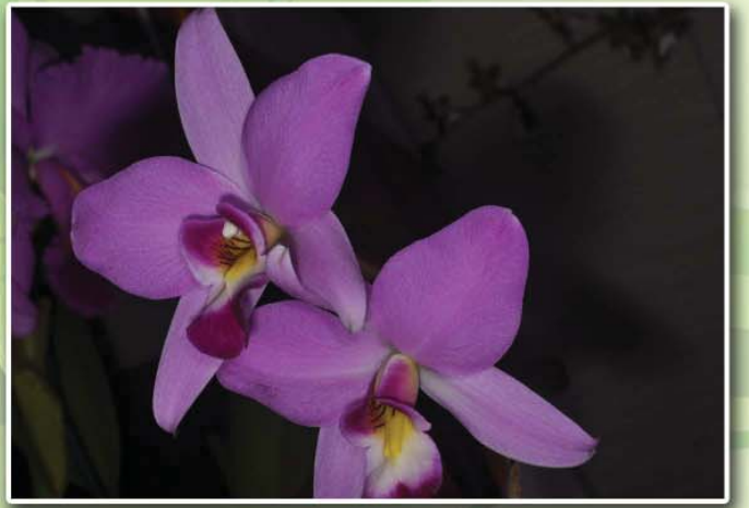
Plant name: Laeilia anceps 'Rustic Delight' Grown by: Yunor Peralta