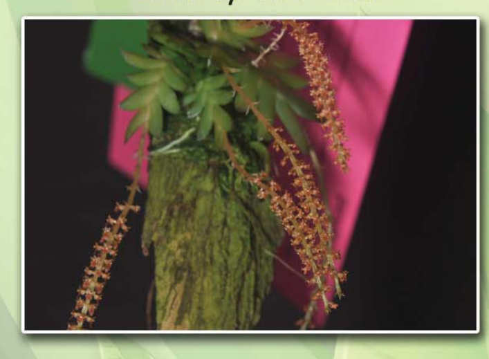
Plant name: Oberonia japonica Grown by: Dave Trebotich