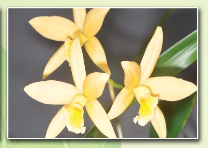
Plant name: Laelia canariensis Grown by: Eileen Jackson