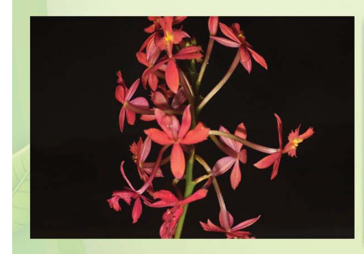
Plant name: Epi Radicans Grown by: Dave Trebotich