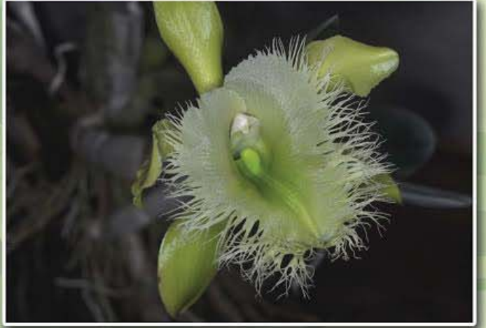
Plant name: Brass digbyana Grown by: Sharon Duffy