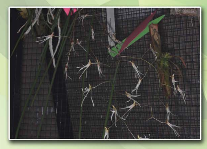
Plant name: Dockrilla teretifolia Grown by: Dave Trebotich