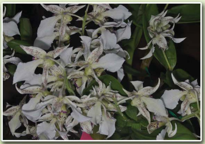
Plant name: Den RoyTokunaga Grown by: Sung Lee