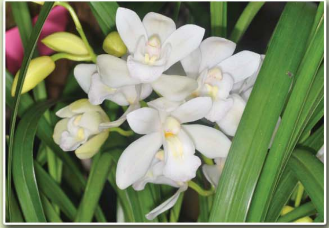
Plant name: Cym Showgirl 'Silky' 'Grown by: Phyllis Arthur