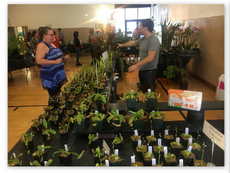
Venders circled the room