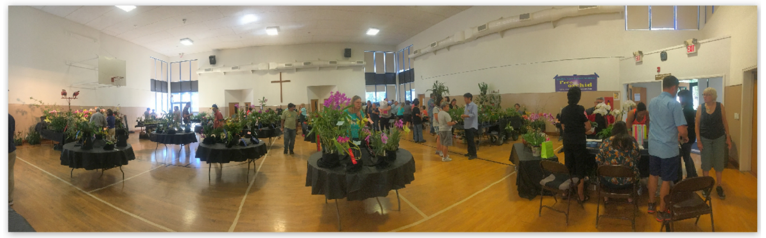
We filled the room with beautiful blooms