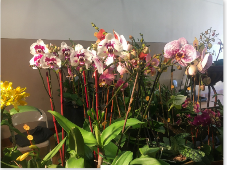
Our raffle prizes