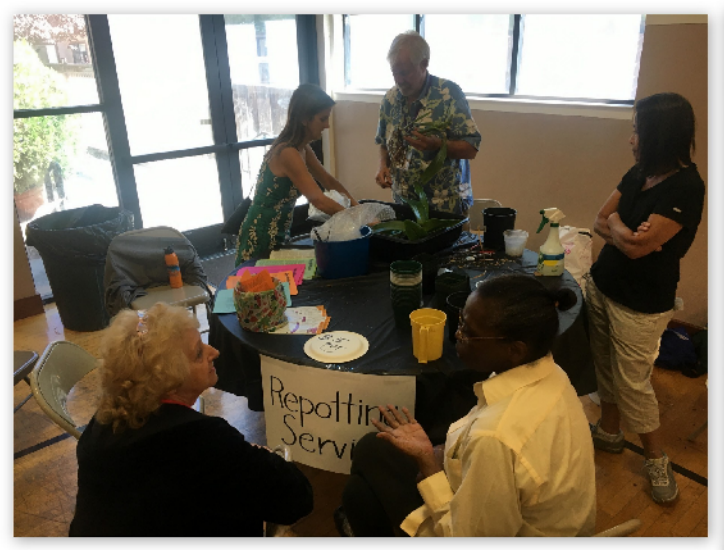
The repotting service was active