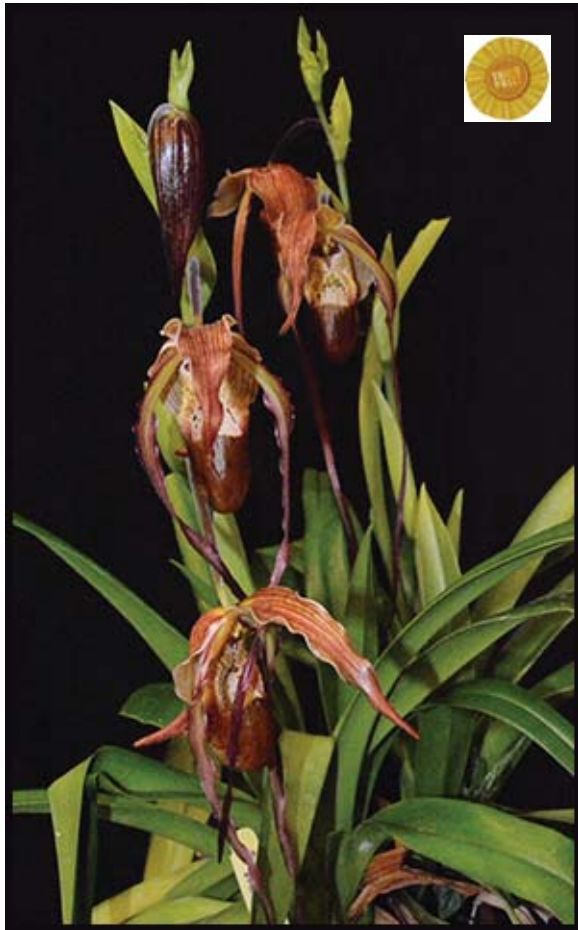
Phrag. (longifolium x warszewiczianum)