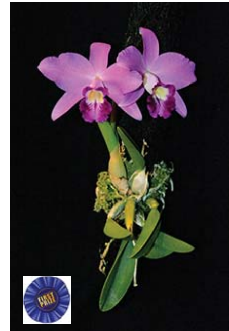
C. sincorana ‘Alpine Meadows’

For more informaton contact AOS2015@ nnvos.org