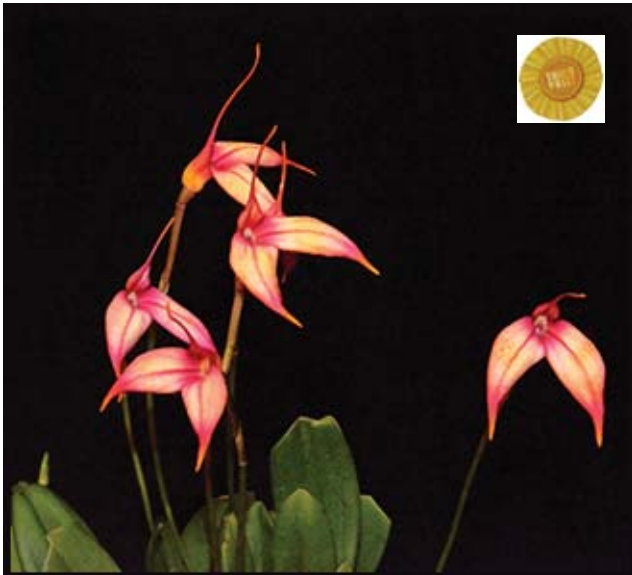
Masd. Zeigler's Love 'Solar Flare'