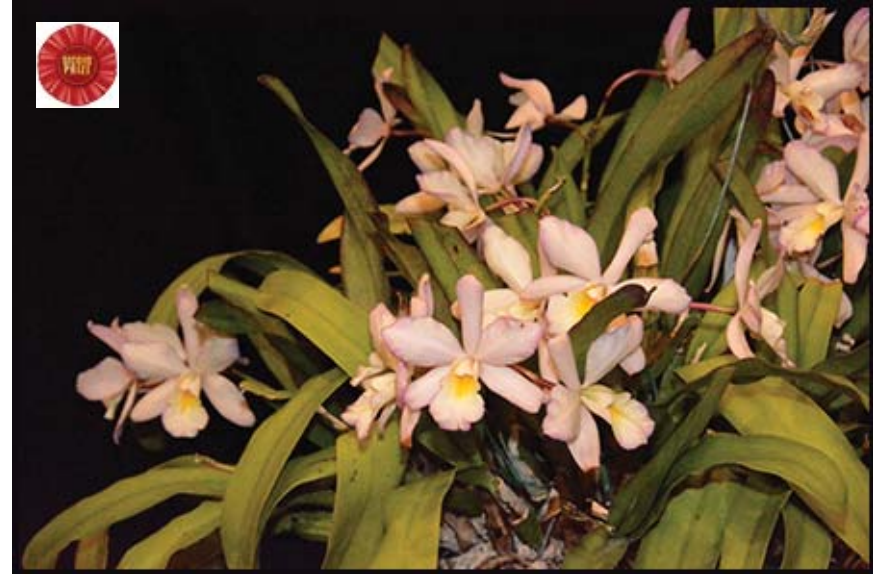
Iwanagara Apple Blossom