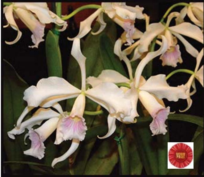
L. purpurata v. russelliana