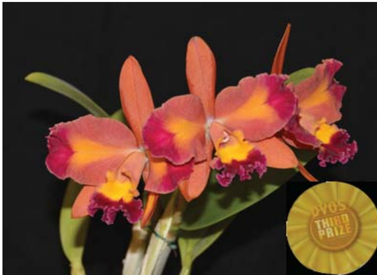
Ctt. Aussie Sunset