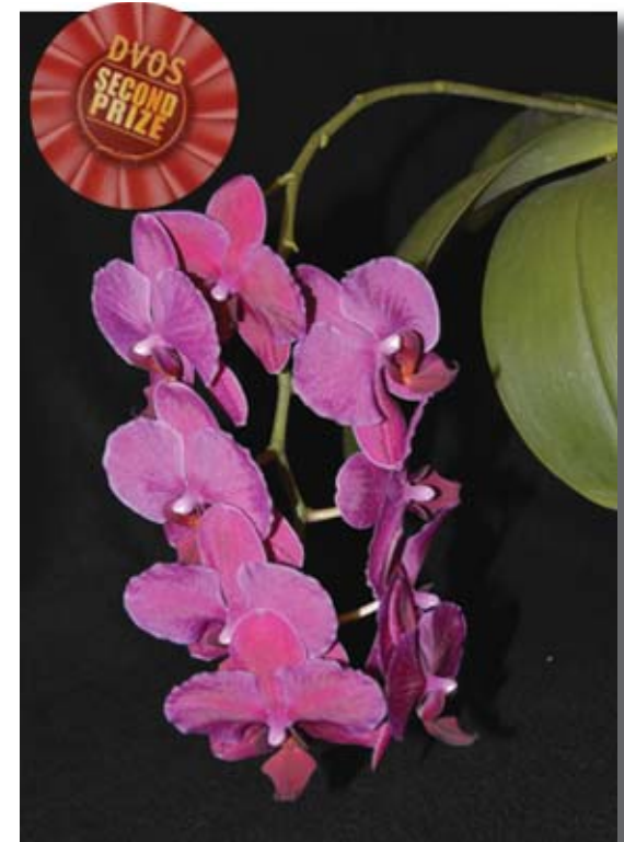
Phal. Barbara King