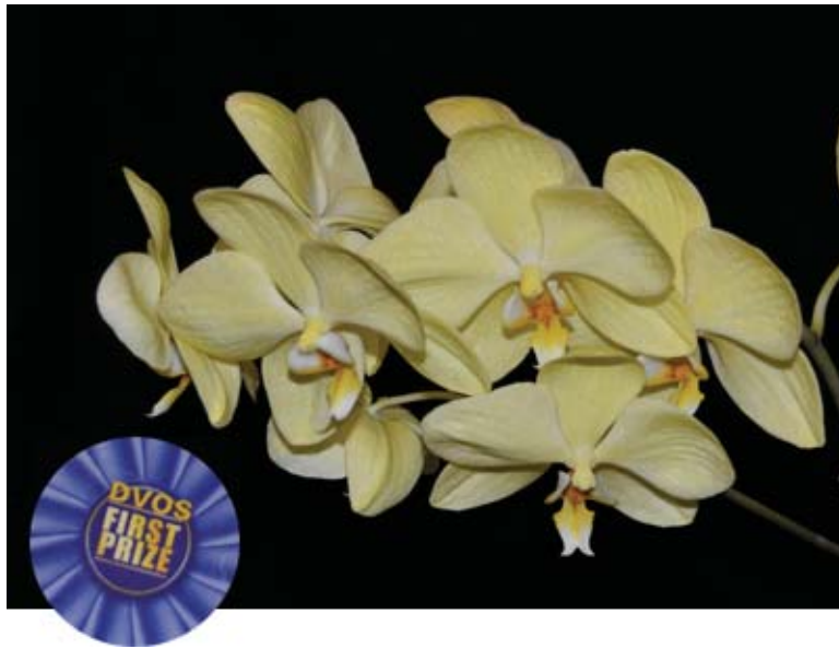
Phal. Golden Emperor