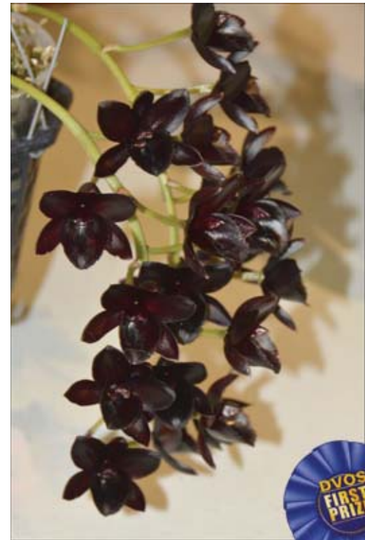
Fdk. After Dark 'Black Pearl'

http://www.orchidconservationcoalition.org