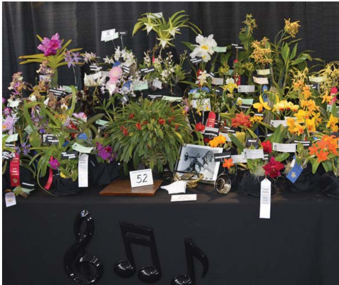
DVOS display at Pacific Orchid Exhibition 2014