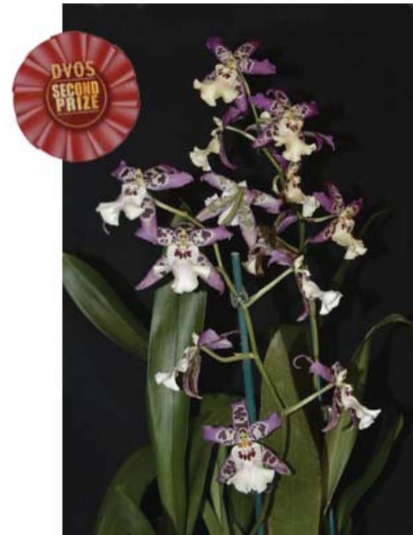
Vul. 'Jerry Lawless'