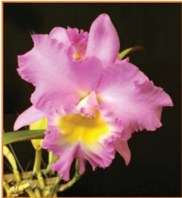
C. Mt. Hood AM/AOS

Dec 11: Annual DVOS Holiday Party (this is a Wednesday ) details in next month's Newsletter