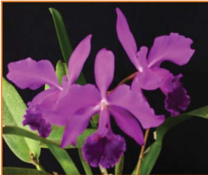
C. labiata v. rubra