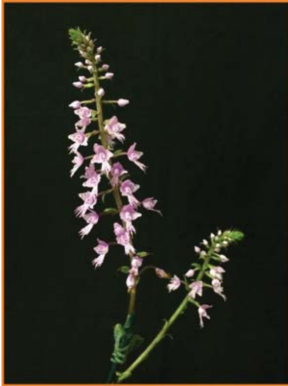
Sngl. longifolia "Belmont"

The sale of member owned plants at DVOS meetings benefits the Club and both the selling and buying members. This is often the best way to obtain inexpensive and/or rare plants. To make this process smoother we will be introducing a new system to expedite these sales.