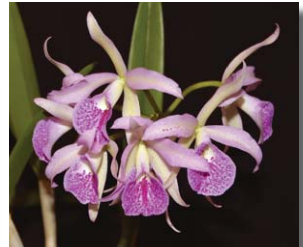
Bc. Maikai 'Mayumi' HCC/AOS