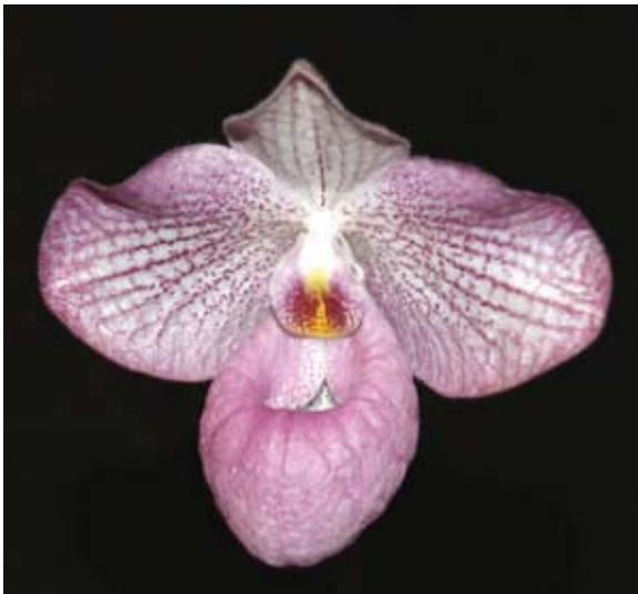
Paph. Magic Lantern