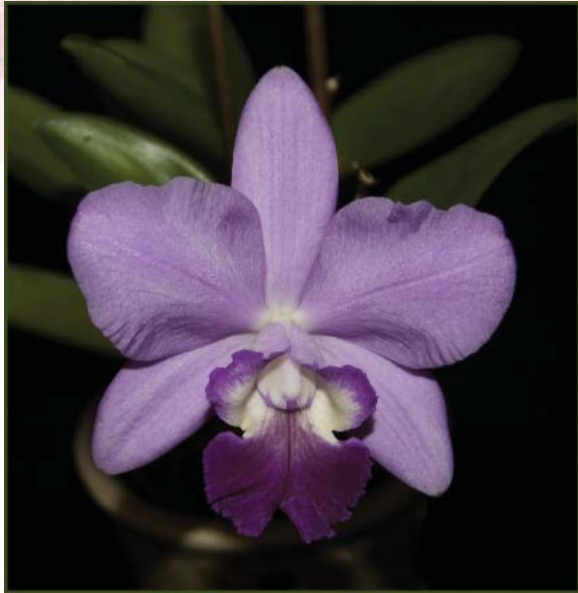
Lc. Hawaiian Ice