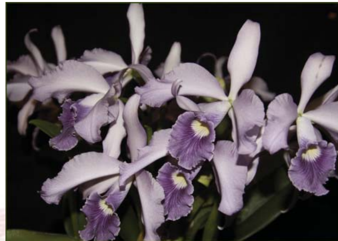
C. Canhamiana 'Azure Skies'

August 18: DVOS Annual Picnic & Auction 'Caribbean Holiday'