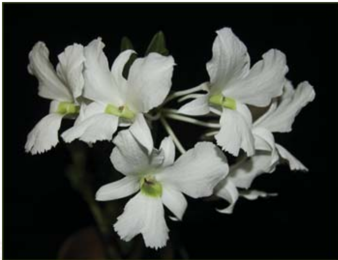
Den. sanderae v. luzonicum

Dinner with the Speakers will be at the Sichuan Fortune House in Pleasant Hill. This will be the only remuneration the speakers get. They have graciously donated the speaker's fee to the AOS for mailing the beginner's book 'Your First Orchid' which one receives as a benefit when one joins the AOS. I'll have AOS applications on hand, *G*.