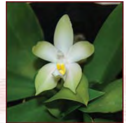
Phal. violacea v. alba