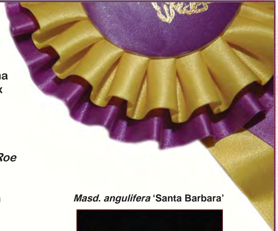
Masd. angulifera 'Santa Barbara'