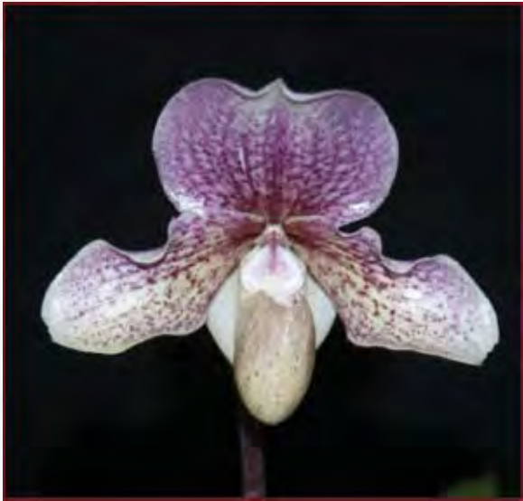
Paph. Princes Sangwan