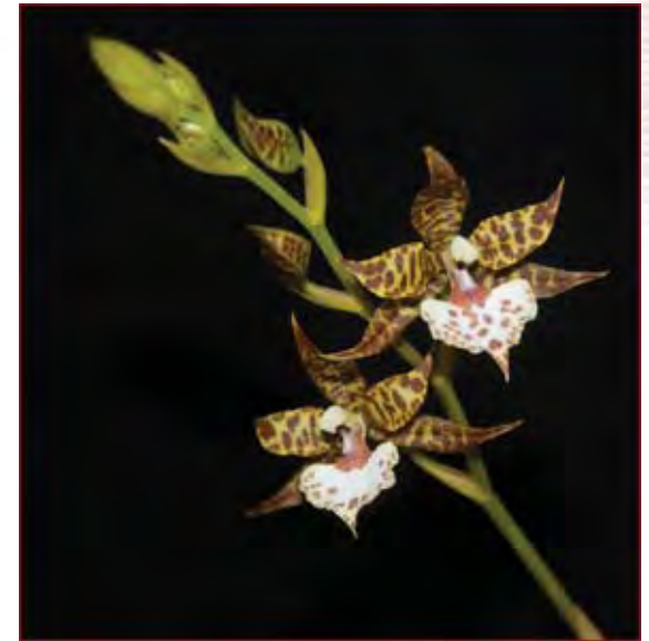
Rhynchostele Red Nugget