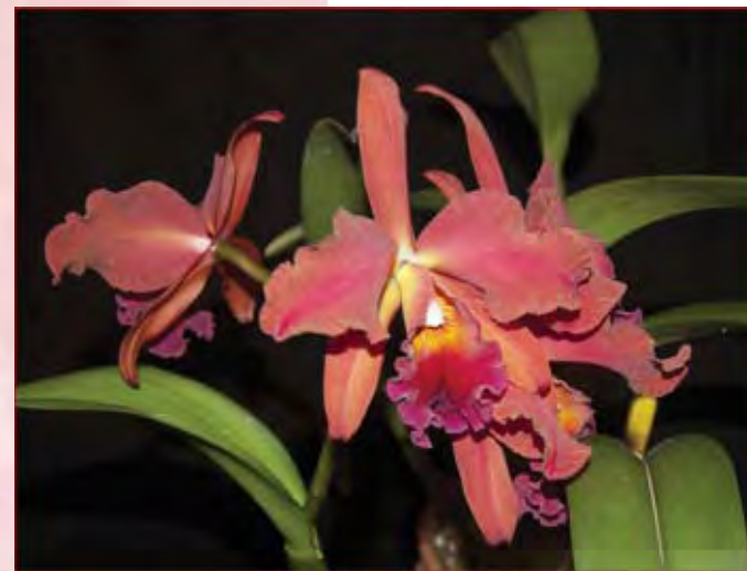
Pot. Russian Lacquer

Odontocidium unnamed hybrid 'Golden Gate' (Odm. Stamfordiense x Onc. wyattianum) AM 80 Exhibited by Golden Gate Orchids