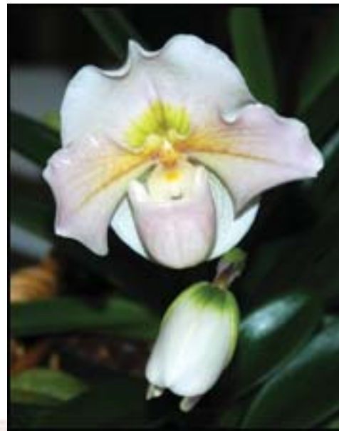
Paph. Snowbird 'Opalescence' AM/AOS

Refreshments for the April Meeting will be provided by: