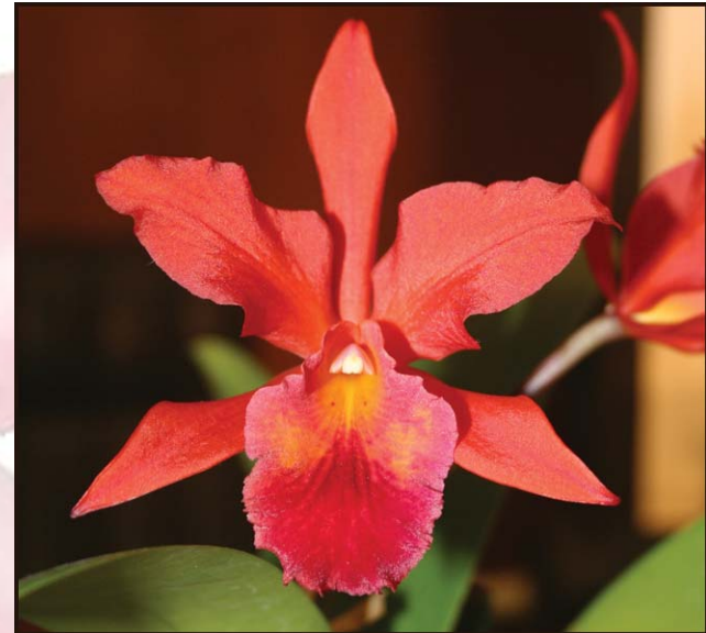
Lc. Carolyn Reid 'Glowing Embers'