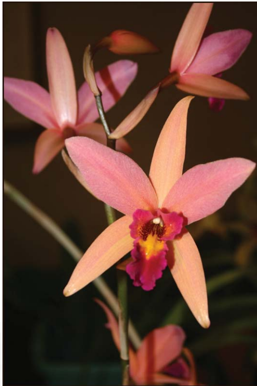
Lc. Santa Barbara Sunset 'Showtime' HCC/AOS

Cymbidium Liquidation (Bulk Buy x Overstock)