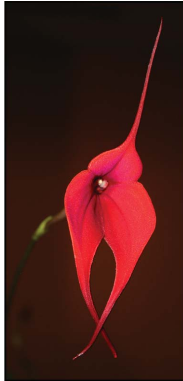
Masd. Annette Hall 'Blazer' x Masd. Falcon Sunrise 'Red Tide'