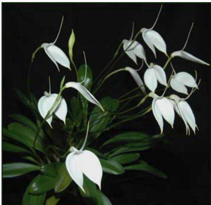
Masd. coccinea v. alba