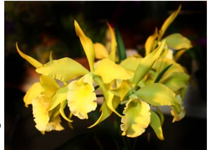
B/c. Everything Nice 'Showtime'