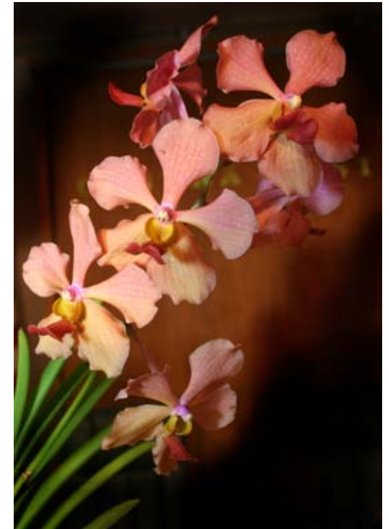
V. Joseph van Blevo x V. Hilo Queen

Orchid Digest - the current issue - July, Aug, Sept. has a very nice article on DVOS. ( last page ).