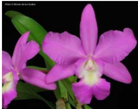
Bc. Erotion 'Persistence' (See p. 10)

Orchid Digest, July-Sept 2010, has a nice article about DVOS and our web site on page 186.