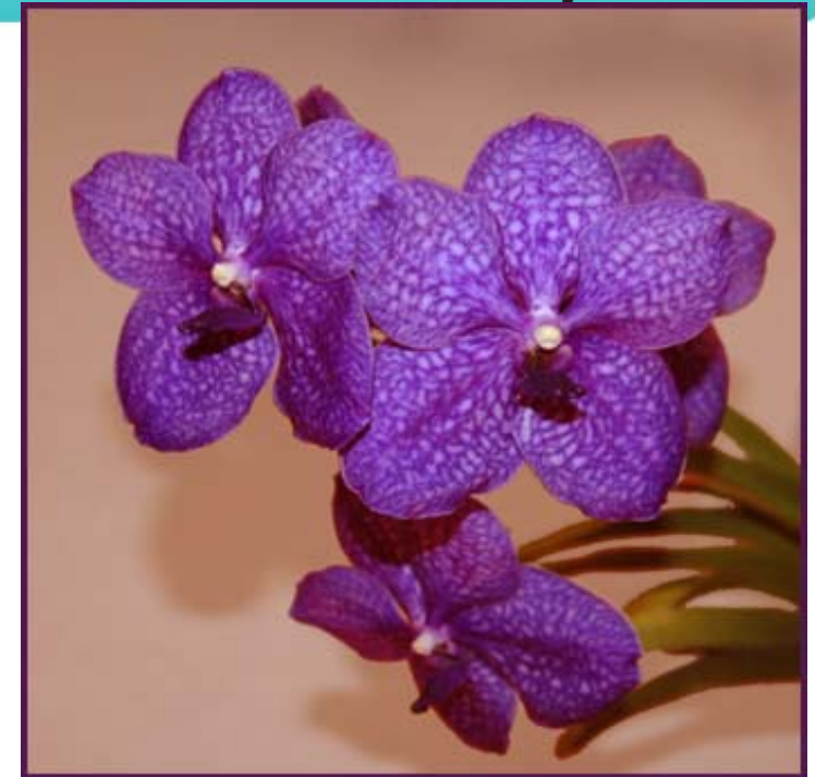
V. Pachara Delight

California Sierra Nevada Judging Center http://www.csnjc.org