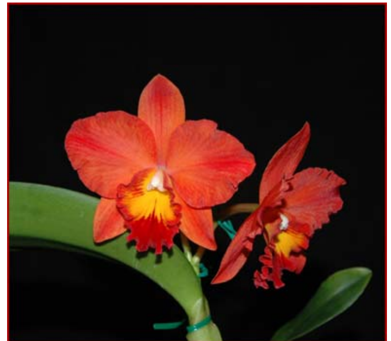
Rth. Gisela Hymmen 'Gary' AM/AOS