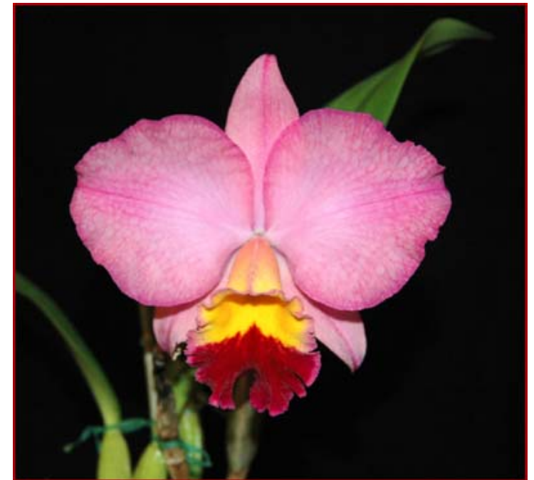
Pot. Golden Circle