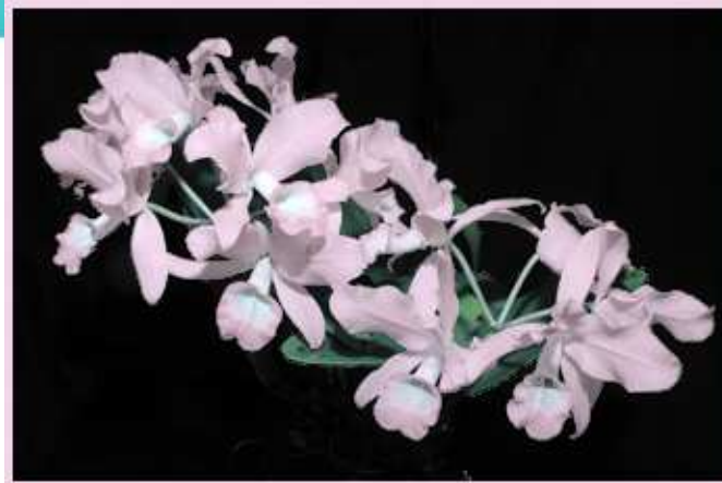
C. skinneri v. coerulea

Lately our meetings have starting and ending late. When we have a lot of Show and Tell plants, as we do this time of year, the meeting can get so far behind schedule that we don't have enough time for our speaker and raffle. Our contract with the Water Board specifies that we are cleaned-up and out of the room by 10:30.