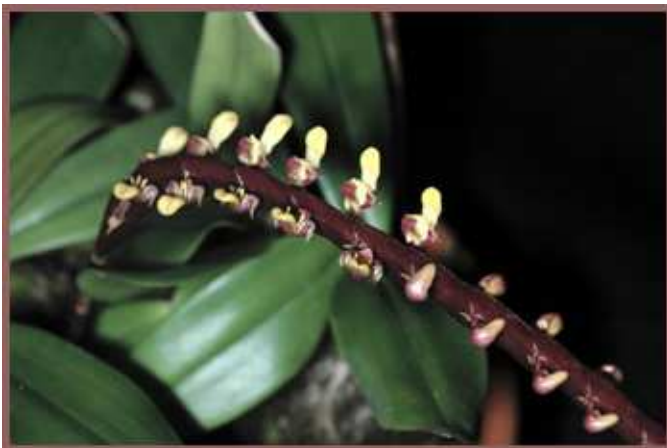
Bulb. falcatum v. velutinum