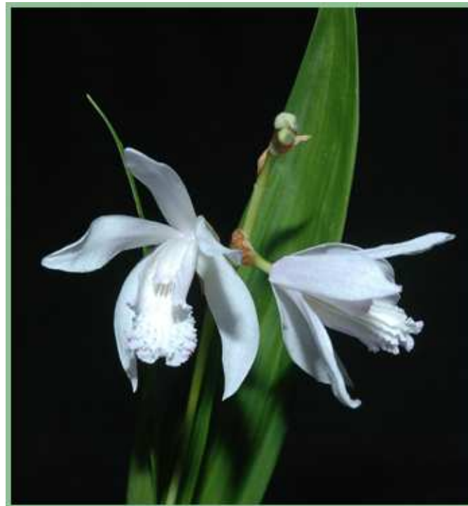
skinneri v. coerulea