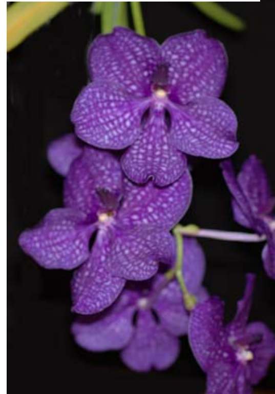
V. Pachara Delight

California Sierra Nevada Judging Center http://www.csnjc.org