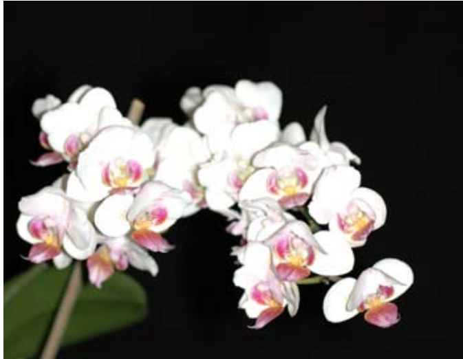
Den. nobile v. cooksonianum