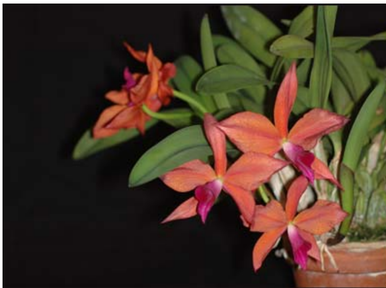
Sl. Gratrixiae 'Jolen' AM/AOS