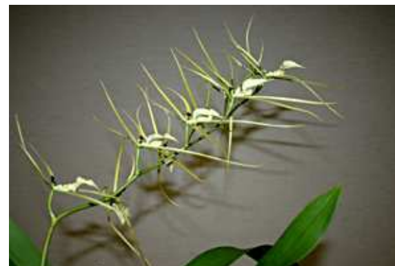
Brassia Rex (above)