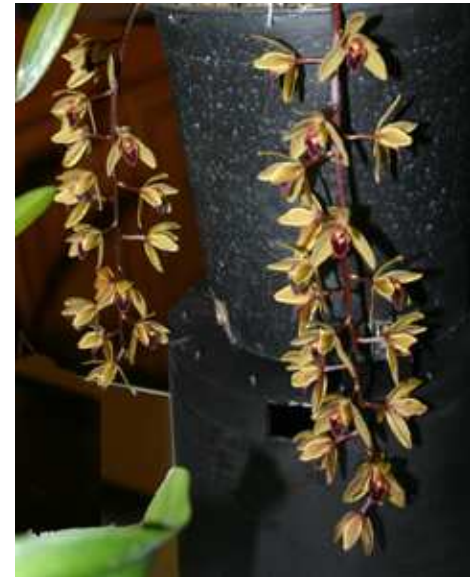
Cym. Sweet Devon 'Sweet'