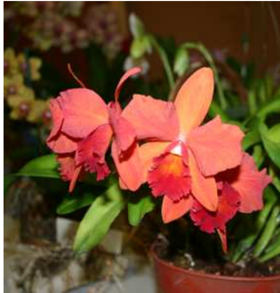
Slc Hazel Boyd 'Orinda' AM/AOS