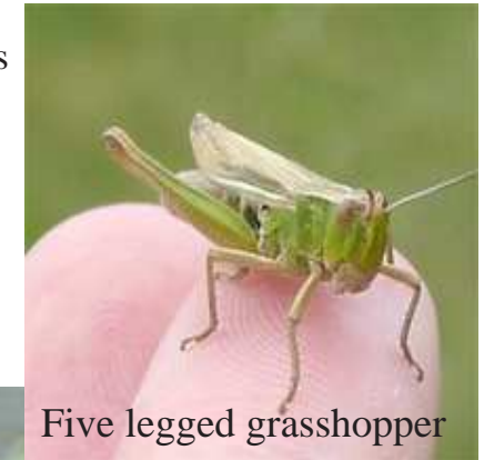
Five legged grasshopper