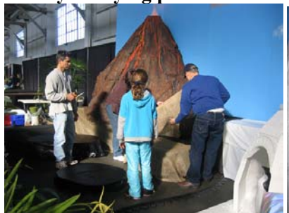
Putting display together