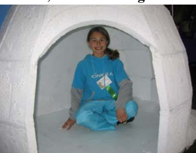
Our Show Mascot