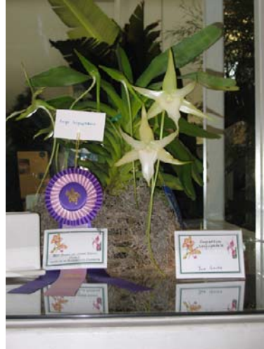
Joe Grillo's Angraecum Sesquipedale