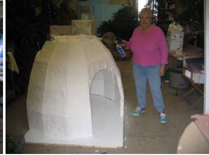
Spraying snow on Igloo