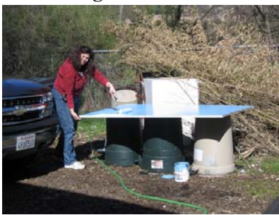
Linda painting panel